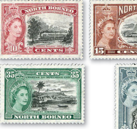
Fig 31 The 75th anniversary of the British North Borneo Company was marked by a special issue in 1956