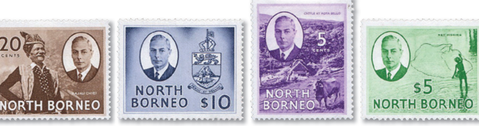
Fig 29 The 1950 George VI pictorials included a mix of relevant designs, such as those used for the 20c. and $10, and some woefully poor theme choices, such as those on the 5c. and $5

Japanese occupation stamps are excluded from this review, as are postage-due labels. There must have been a colossal number