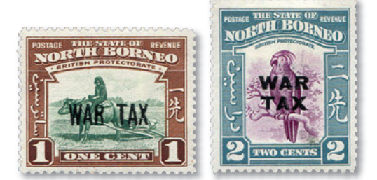
Fig 25 Two different type fonts were used for war tax overprints applied in 1941