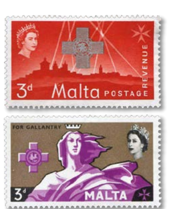
Fig 31 Annual issues from 1957–60 marked the anniversaries of Malta being awarded the George Cross