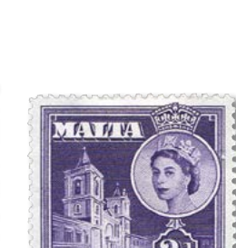
AL VISIT 19