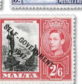
Fig 23 'SELF-GOVERNMENT 1947' overprints were applied to all definitives in 1948. Flaws showing the 'NT' joined can be found on the 1/2d., 11/2d., 3d. and 5s. stamps