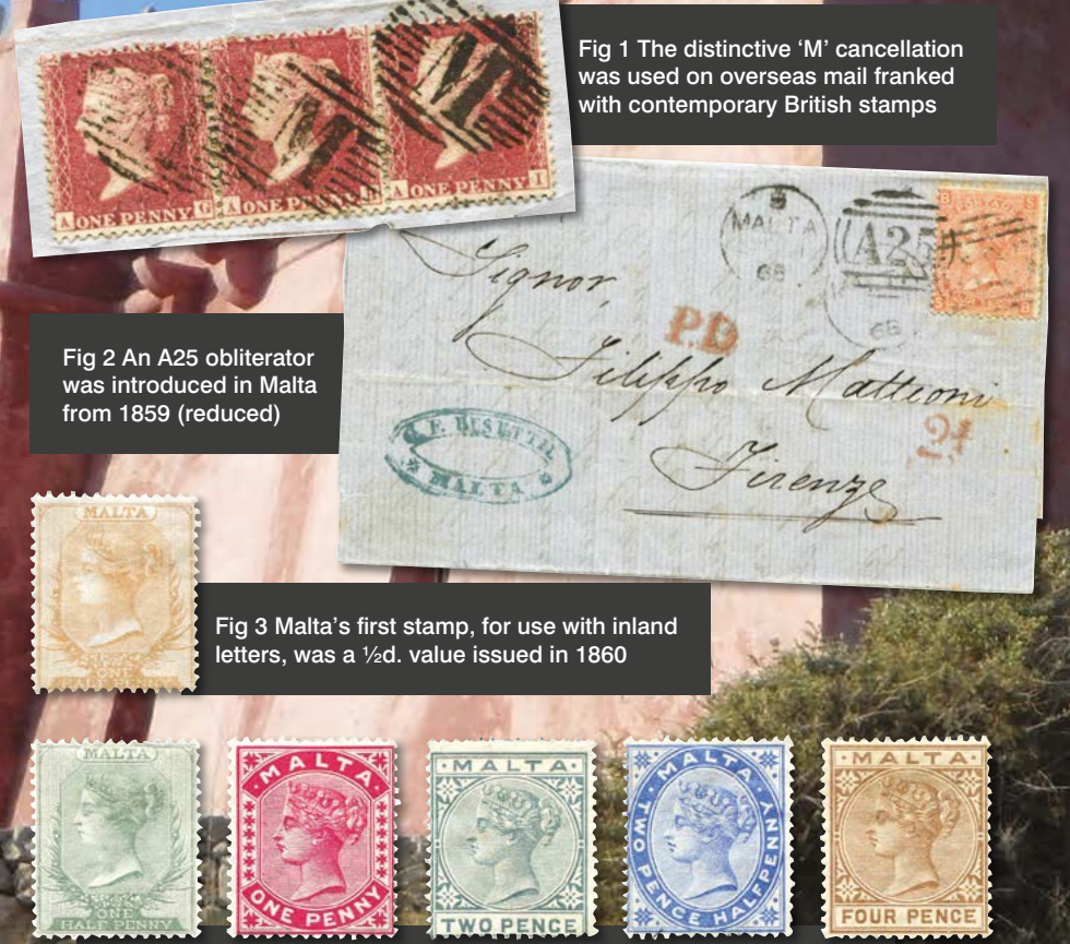
Fig 4 When the British GPO relinquished control over Malta's overseas post, a new set of definitives was issued in 1885

From 1855 to 1884, all overseas mail required the use of contemporary Great Britain stamps. These are readily identified by the wavy line obliterator in use between 1855 and 1856, the distinctive 'M' cancellation introduced in 1857 and the A25 obliterator in use from 1859 ( Fig 1 and Fig 2 ). Malta's first stamp in 1860, on unwatermarked paper, was printed by De La Rue, who provided